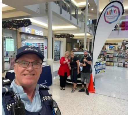
In the first week of December 2022, NSH team participated in Mall Cops event at Chartwell Square.